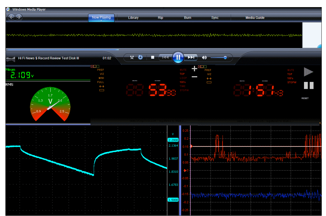
Fig1: Screenshot of Dialog's DA7210 Class G-ClassAB discharge demo suite

A screengrab of this setup is shown below. The voltage meter and discharge is shown in the left hand panes, on the bottom right pane the oscilloscope shows one headphone channel output (blue) and the corresponding Class G positive rail (red). The timers capture the supply capacitor discharge from approximately 2.1V to 1.85V.